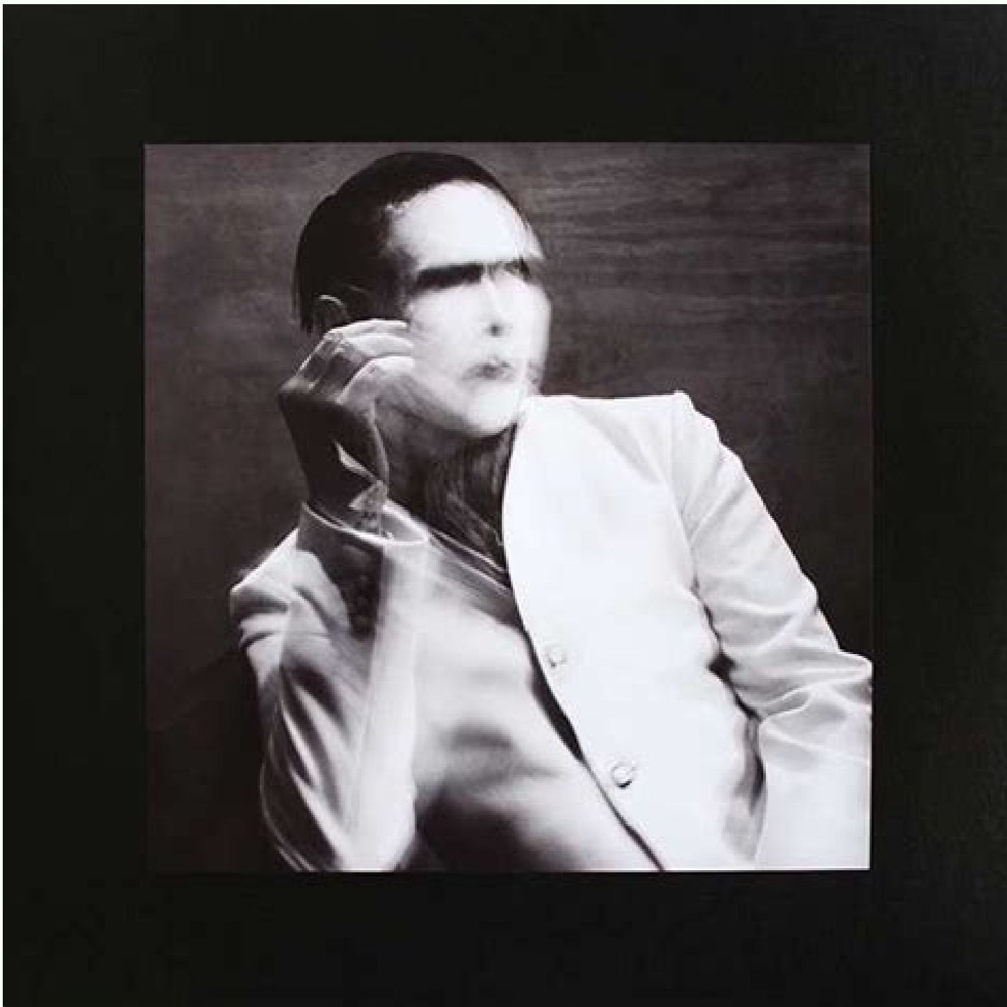
Marilyn manson killing strangers download mp3. Download lagu marilyn manson killing strangers.